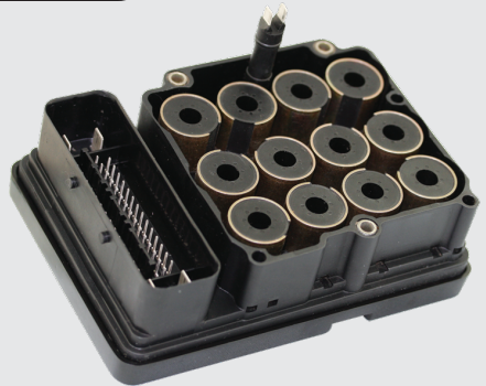
Fig. 1 Brake Control Module